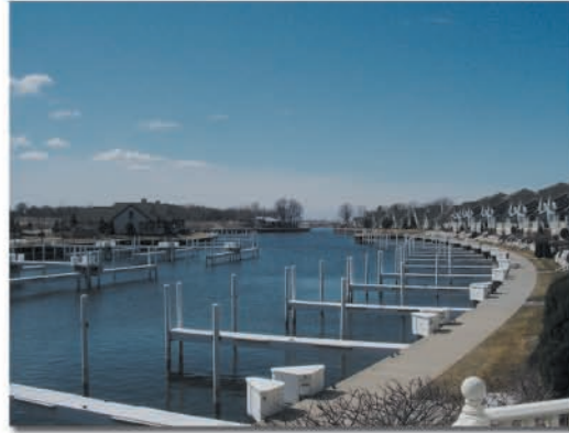
Harbor Village Marina view from deck