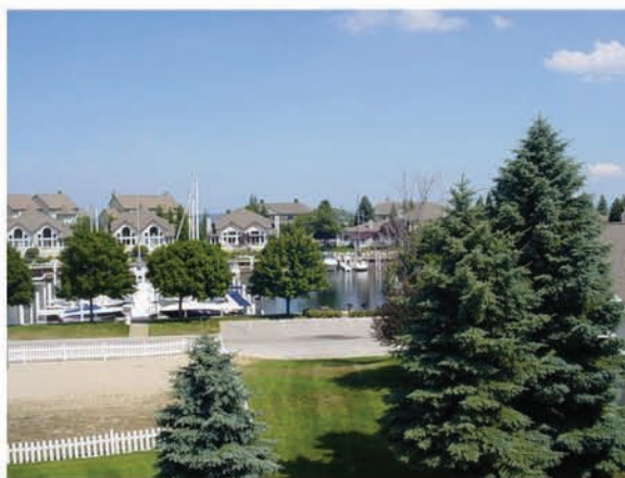
View of Harbor Village Marina from deck